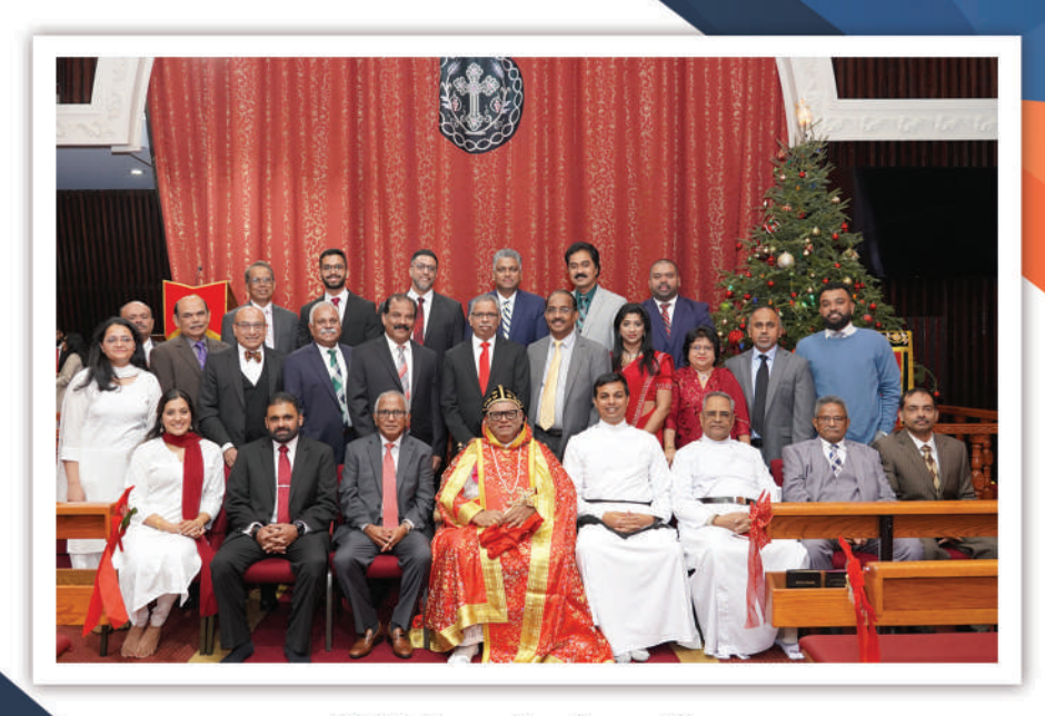
2025 Executive Committee