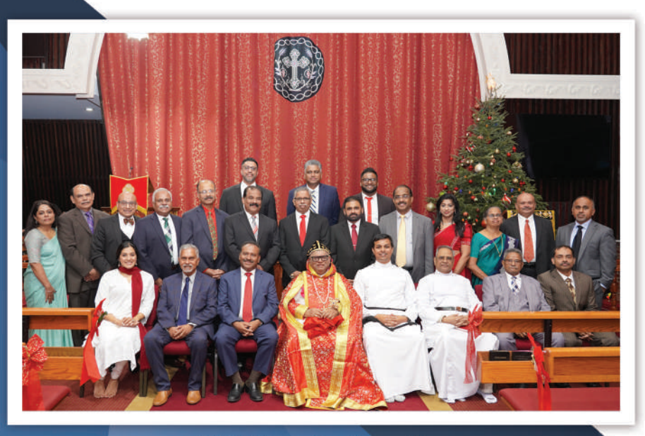
2024 Executive Committee