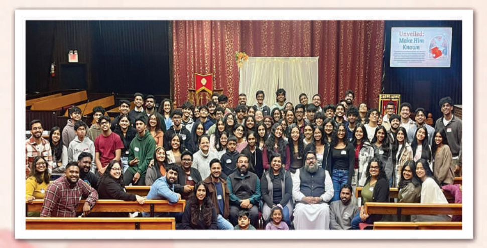
NERYF One Day Conference at LIMTC