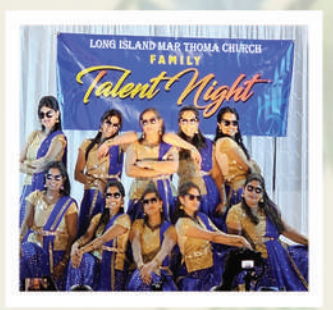
2024 Family Talent Night